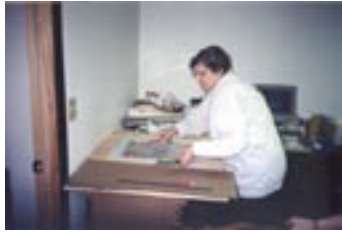
Straightening an icon