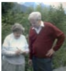
With Librarian of Congress James Billington