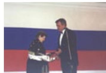
At the San Francisco Consulate